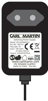
Model. 08210-1 EURO Plug type