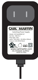
Model. 08210-2 USA Plug type